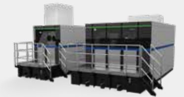
M Line Factory