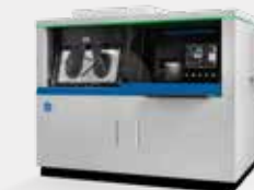
M2 Series 5